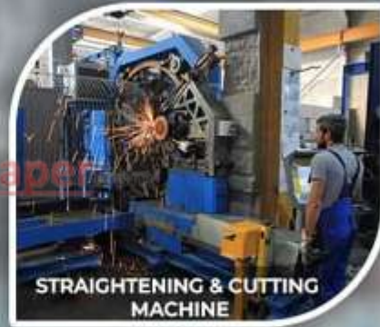
STRAIGHTENING & CUTTING MACHINE