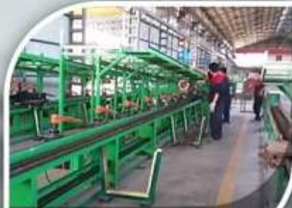
COLD DRAWING MACHINE